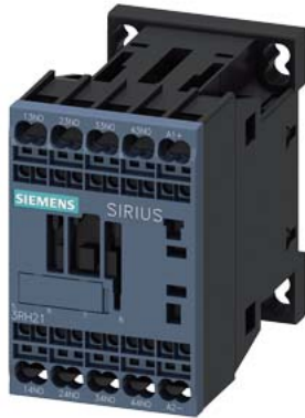
Contactor relay, 4 NO, 24 V DC, Size S00, Spring-type terminal